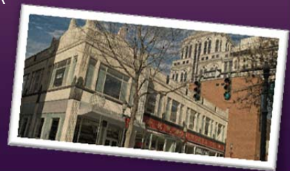
Greensboro's Intl. Civil Rights Museum