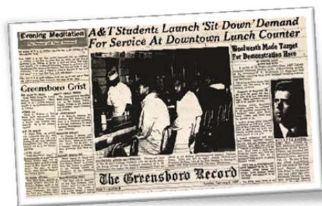
Newsprint from Greensboro's Intl Civil Rights Center and Museum website

The International Civil Rights Center & Museum in Greensboro, N.C. is taking part in commemorating Black History Month. The archival center, collecting museum and teaching facility is devoted to the international struggle for civil and human rights. The Museum celebrates the nonviolent protests of the 1960 Greensboro sit-ins that served as a catalyst in the civil rights movement. $8 will buy students a ticket to a number of exhibition tours, events, films and panel discussions all this month. www.sitinmovement.org