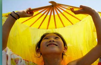
March 20 International Day of Happiness