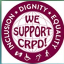
Mental Retardation Awareness Month