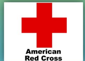
American Red Cross Month