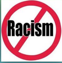
March 21 International Day for the Elimination of Racial Discrimination

ASU COUNSELING & PSYCHOLOGICAL SERVICES CENTER